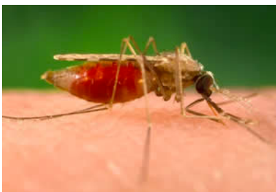
An Anopheles mosquito

A person with malaria develops a fever and flu-like symptoms. Most who are infected with malaria recover, but it can be fatal, especially in children. Each year there are between 350 million and 500 million cases of malaria worldwide. Over one million of those people die from the disease. Malaria is the number one cause of death for children under age five in Benin.