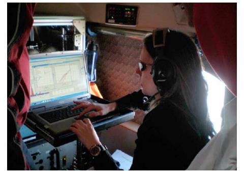
Research scientist monitoring data collection