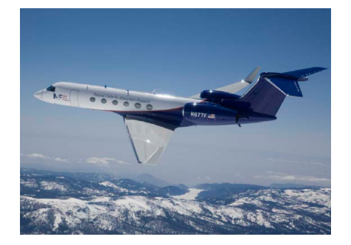
High-flying Research Aircraft