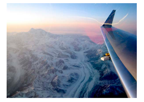
Flying back from the North Pole by Mt. McKinley